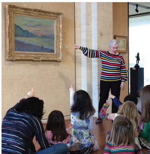
First Studio participants examine Monet's Sunset at Pourville