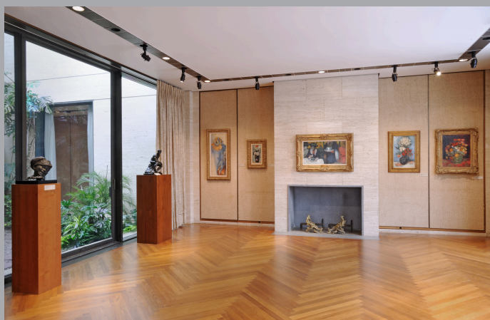
The Atrium Gallery

Join us select Saturdays throughout the season for programs that engage with the Museum's permanent collection, as well as the wider DC arts community. Programs include gallery talks, pop-up performances, classes in the Sculpture Garden, and more. Visit kreegermuseum.org for new program announcements.